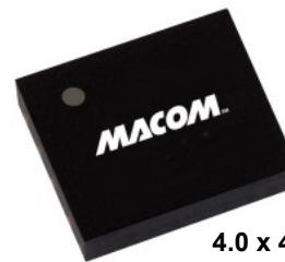
4.0 x 4.5 mm DFN